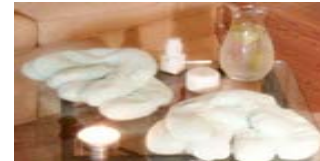
Aromatherapy Neck Wraps - $30