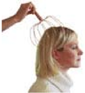
Scalp Massager - $30

Entire Spa ReTREATment set - $100 (Includes all 4 items)