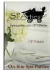
SPArties Magnet - $5