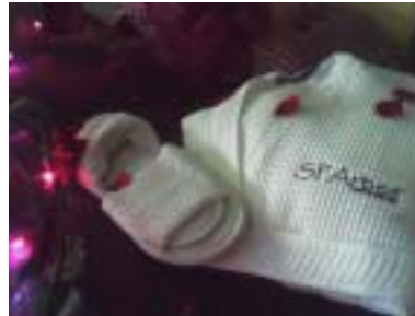
SPArties Robe & Slippers - $25